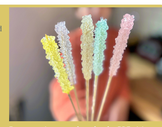
For more tips or to download a PDF visit www.akronfossils.org/downloads

The Science: Crystals form when molecules arrange themselves in a uniform and repetitive pattern. The saturated sugar solution creates the perfect environment for this to happen. The sugar particles continuously bump into each other and start to stick together. These clumps of particles begin to attract more and more to join them. This is how the crystals grow!