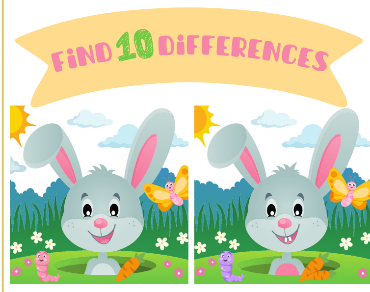
Can you spot the differences between these two pictures?

www.akronfossils.org/day-camps-registration